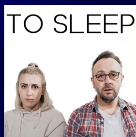
To Sleep by Madam Renards

Friday 14th July 7pm The Blue Orange Theatre Tickets £10