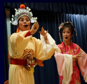
Eternal Love on Stage by Allcam Chinese Culture

Fri 14th & Sat 15th July 8pm The Crescent Theatre Tickets £10.80 (£8.64)