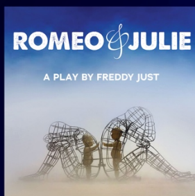
Romeo & Julie by Bewdley Town Criers